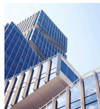
Commercial & Shopping Centres