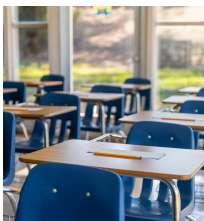
Schools & Education