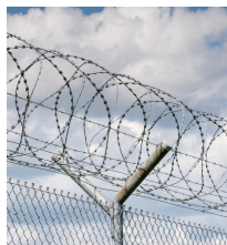
Immigration & Correctional